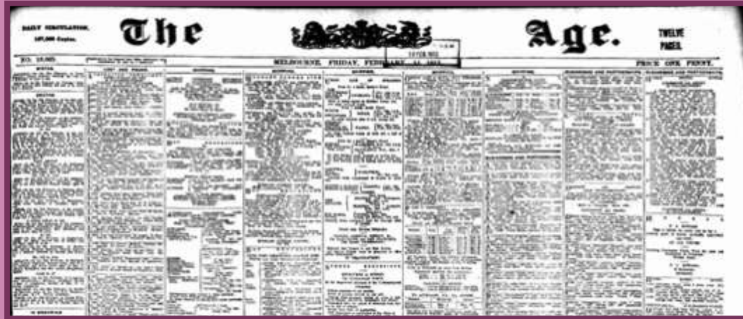
The front page of the Melbourne newspaper The Age from Friday 14th February 1913