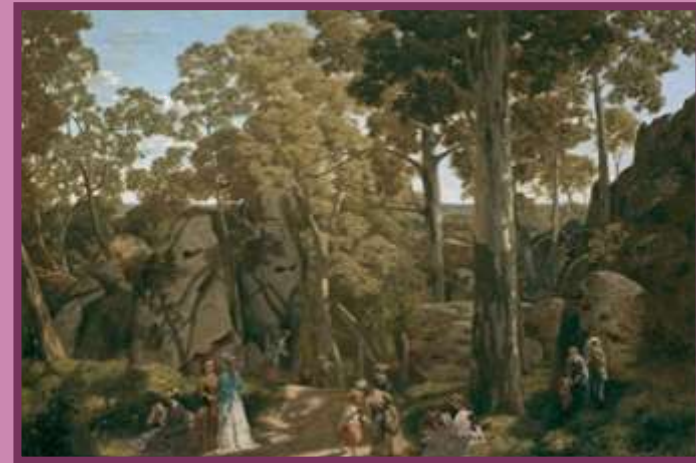
Ford, William. At the Hanging Rock. 1875, oil on canvas. National Gallery of Victoria, Melbourne.